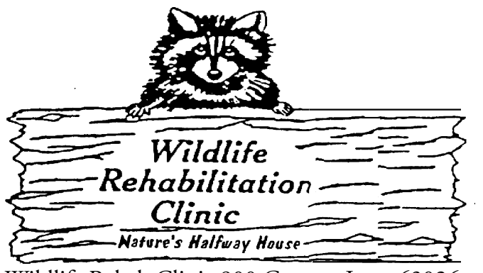
Wildlife Rehab Clinic 900 Gregory Lane 63026